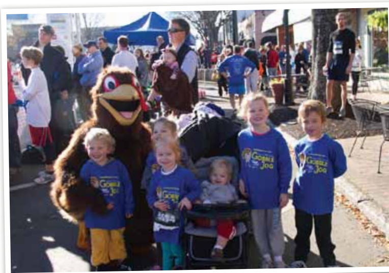
The new Gobble Jog mascot is a big hit with children... and everyone.