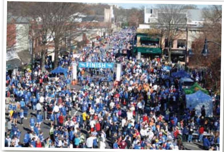
When 9,400 participants and their cheering fans flood the Finish Line, it's a site to see!

For years, MUST Ministries has been synonymous with meaningful events. The Gobble Jog has become a Thanksgiving tradition for people all over America. One of the largest races in the South, the 10K, 5K, 1 mile and Tot Trot create a festive environment for families and friends gathering on the historic Marietta Square. The annual gala celebrates the many lives transformed by MUST and the generous support that makes it possible.