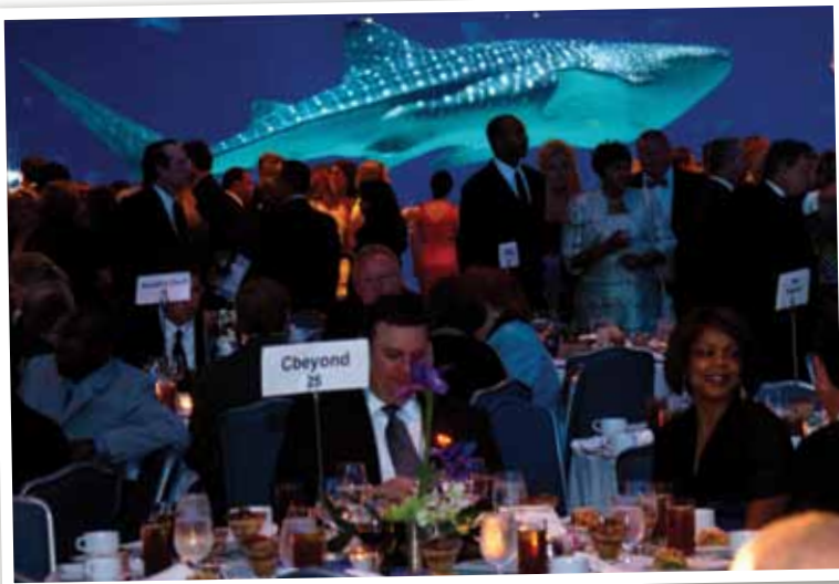
Dinner by the Georgia Aquarium fish tanks is an amazing experience.