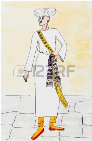
Simple line drawing