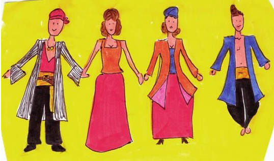
A younger contestant