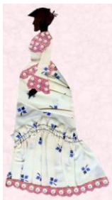
This one is a collage, using fabric.